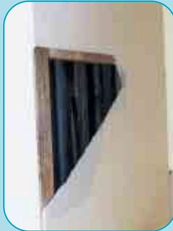
Asbestos insulation board (AIB)