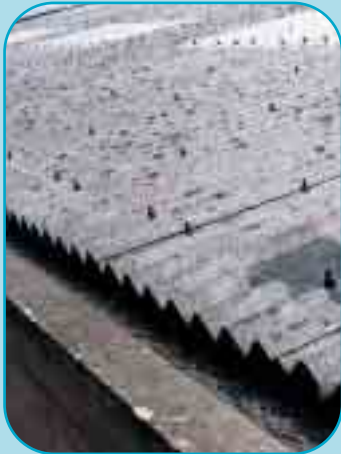
Asbestos cement roof