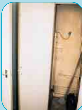
Door with AIB panel