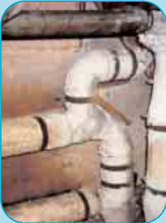
Asbestos pipe lagging