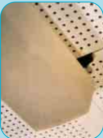
Perforated AIB ceiling tiles