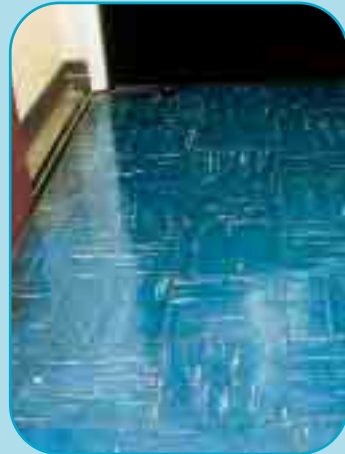
Asbestos-containing floor tiles

Remember, although these are the most likely uses and places where asbestos will be found, asbestos was used in many other materials. If you are in doubt, it is safer to presume that a material contains asbestos, unless there is strong evidence that it does not.